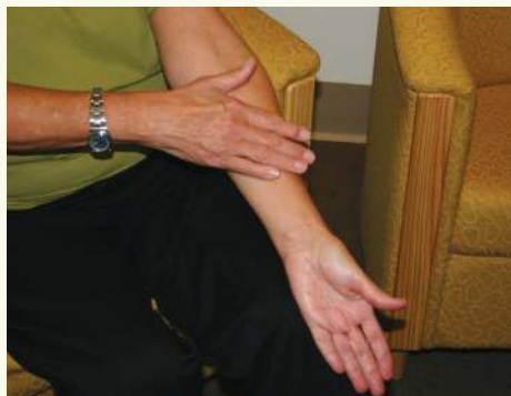
Fig 6. Apply moisturiser by stroking upwards.