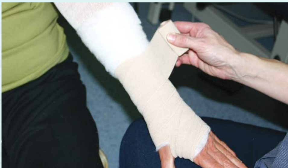
Fig 10. Bandaging the arm from the hand upwards has a similar effect to a compression garment.

the arm, and into the cleared trunk area. The exercises are gentle, and they are done each day. A lymphoedema therapist can teach you these exercises.