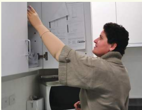
Fig 5. Using your arm as normally as possible is important.