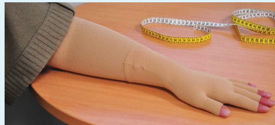
Fig 9. Compression garments can reduce swelling caused by lymphoedema.

There are exercise programs that help move extra fluid out of the affected arm. The exercises encourage fluid to clear first from the trunk and abdomen. Then they target the shoulder, arm and hand, to encourage the fluid to move out of