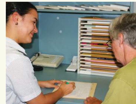
Fig 7. Learning to look after your arm is important when you have been treated for breast cancer.

to fly, speak to your lymphoedema therapist about things you can do to help your arm while flying. This can include wearing a compression sleeve and completing regular exercises.