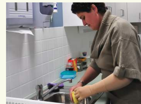
Fig 4. Using your arm as normally as possible is important.