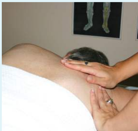
Fig 8. Massage techniques may help move fluid out of the arm.

a qualified lymphoedema therapist. A lymphoedema therapist is an occupational therapist, physiotherapist or nurse who is specially trained to treat lymphoedema. They can be found at www.nlpr.asn.au .